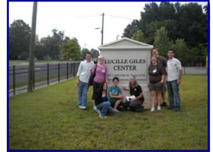
PTK Members volunteer at the local Men's Winter Shelter